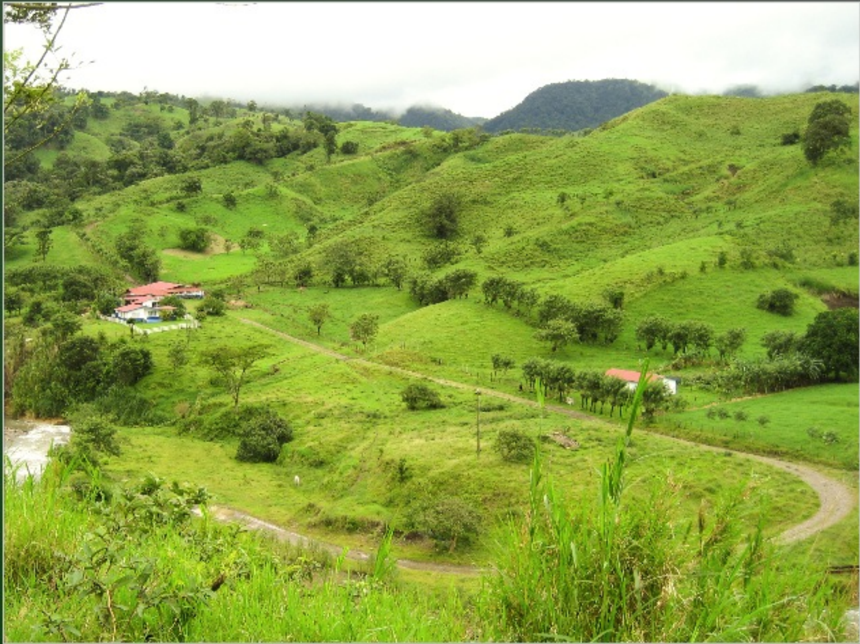
"The Costa Rican countryside on the road to Monteverde looks like a scene from a story book."