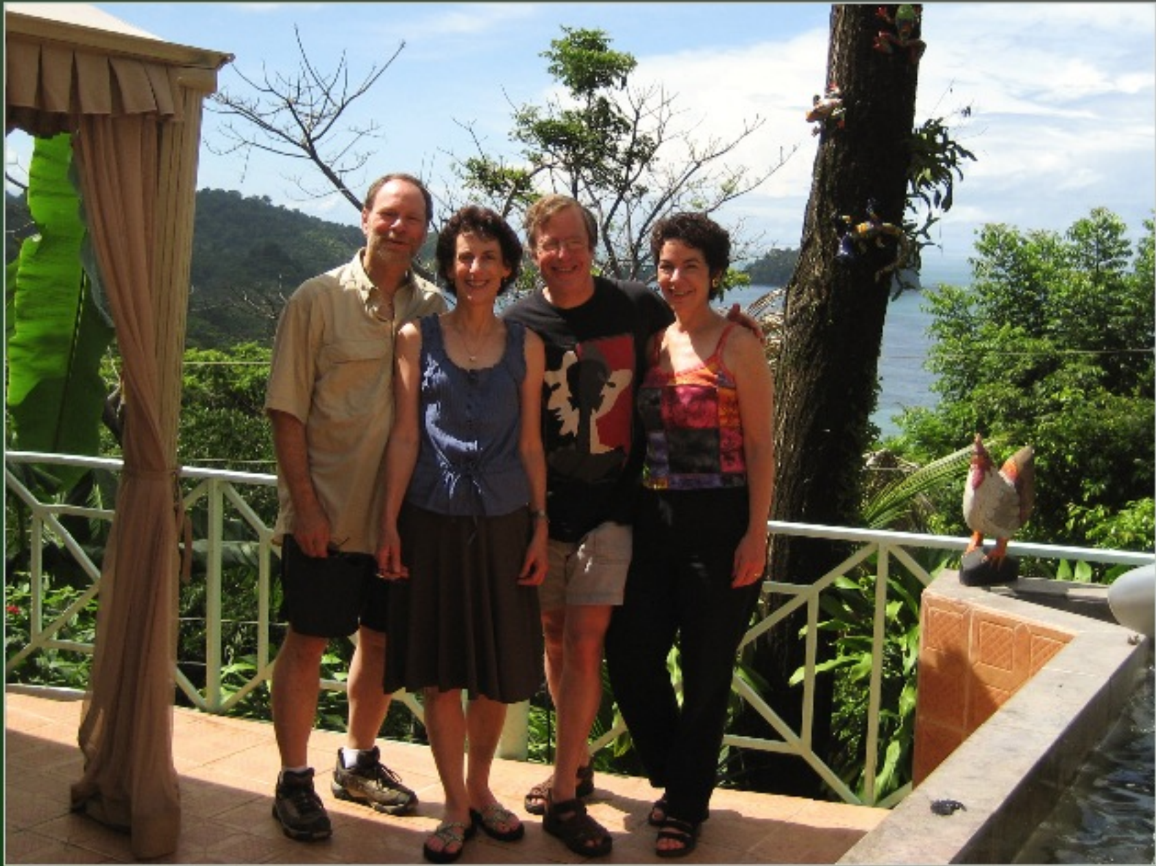
"At the lovely Mansion Inn in Manuel Antonio, we all posed for a photo after breakfast on the terrace."