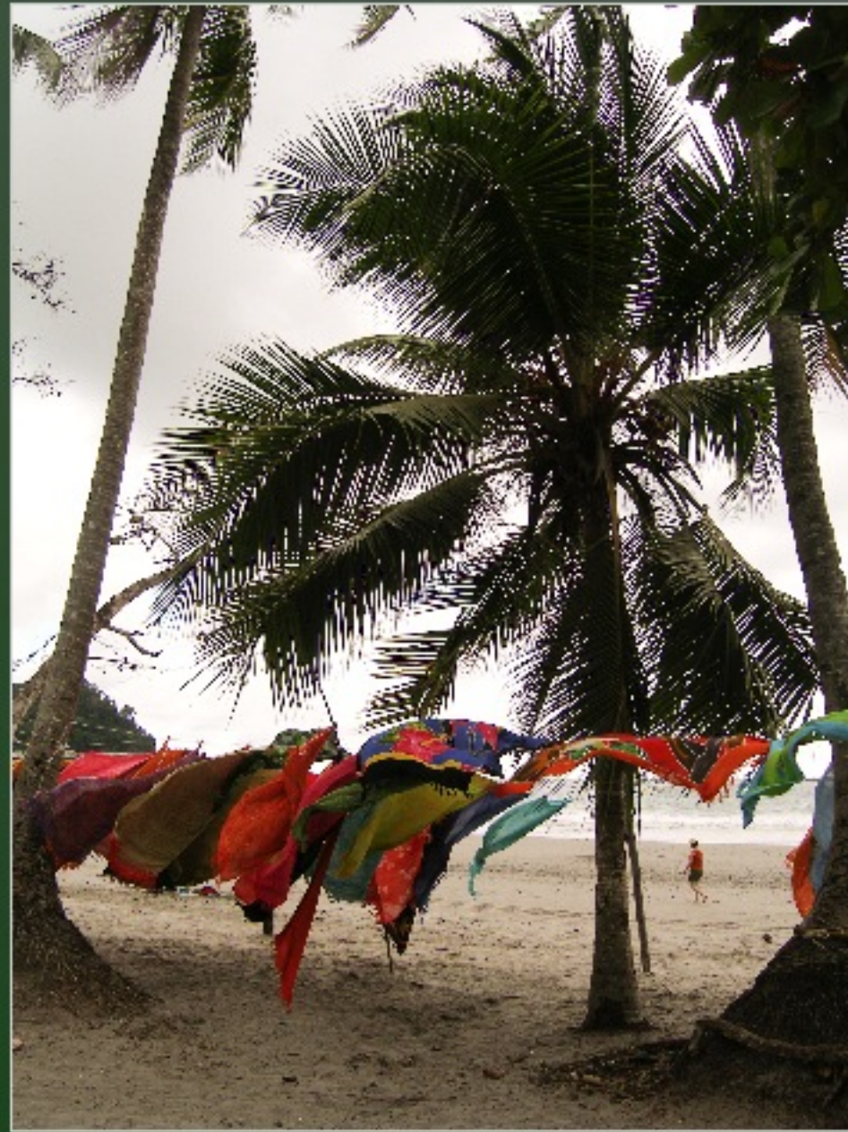
"Colorful beach towels blowing in the wind at the beach next to Manuel Antonio Reserve."