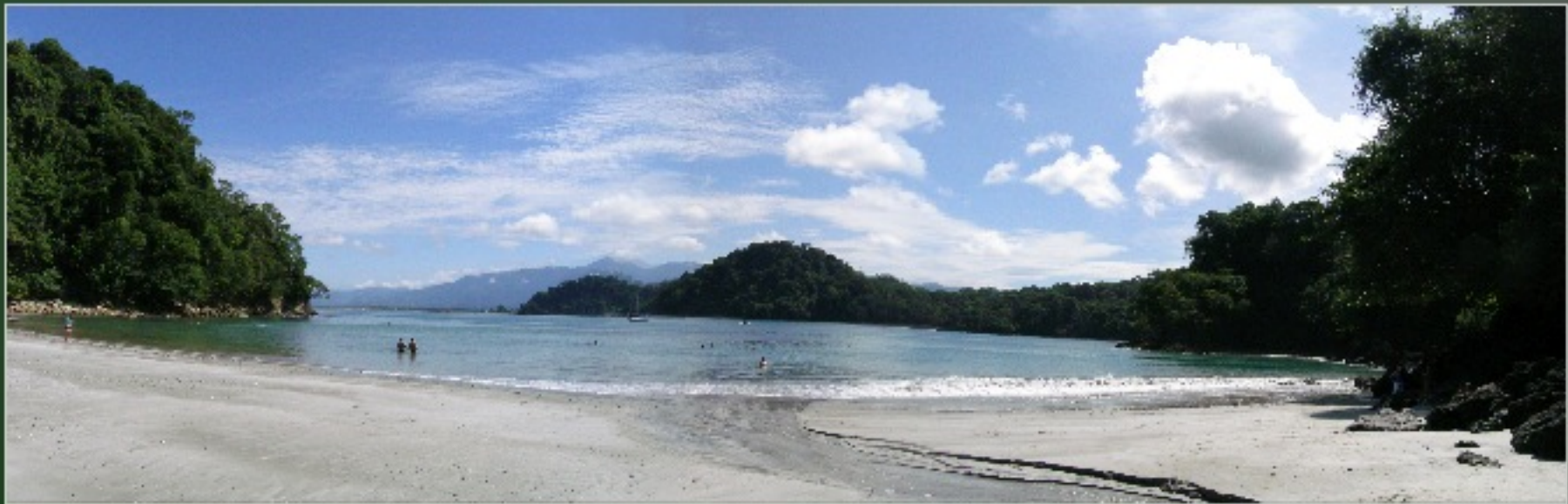
"Second Panorama of Pisan Beach in Manuel Antonio—Blend of 3 individual photos"