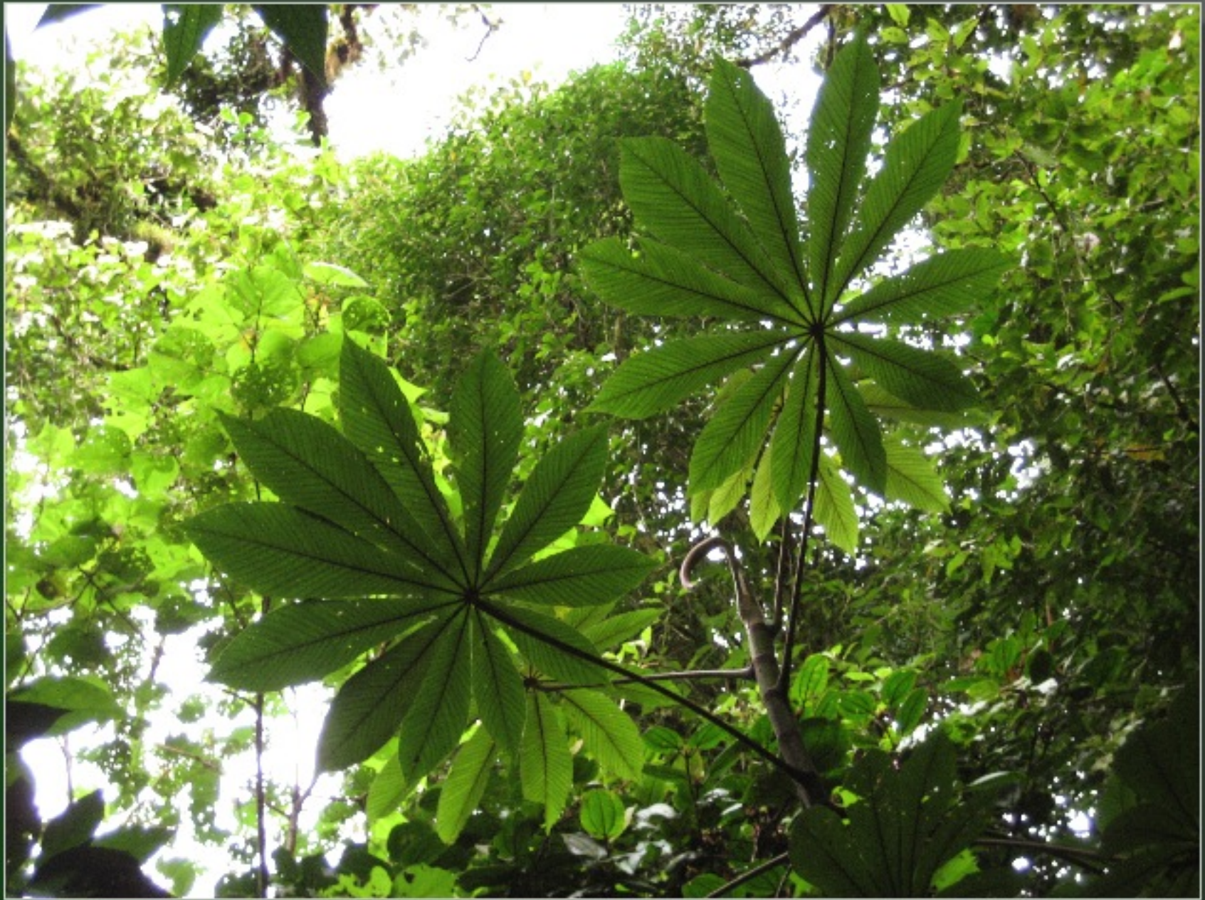
"Beautiful round ferns in the rain forest at Monteverde."