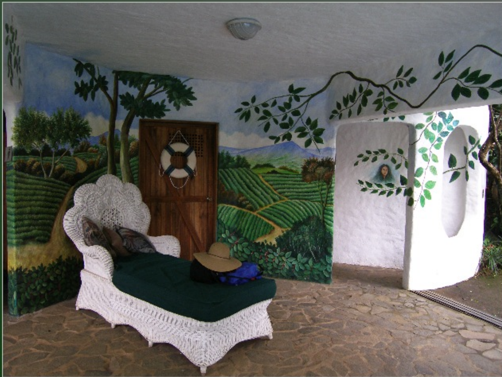
"The mural inside the pool cabana at the Finca Rosa Blanca Inn"