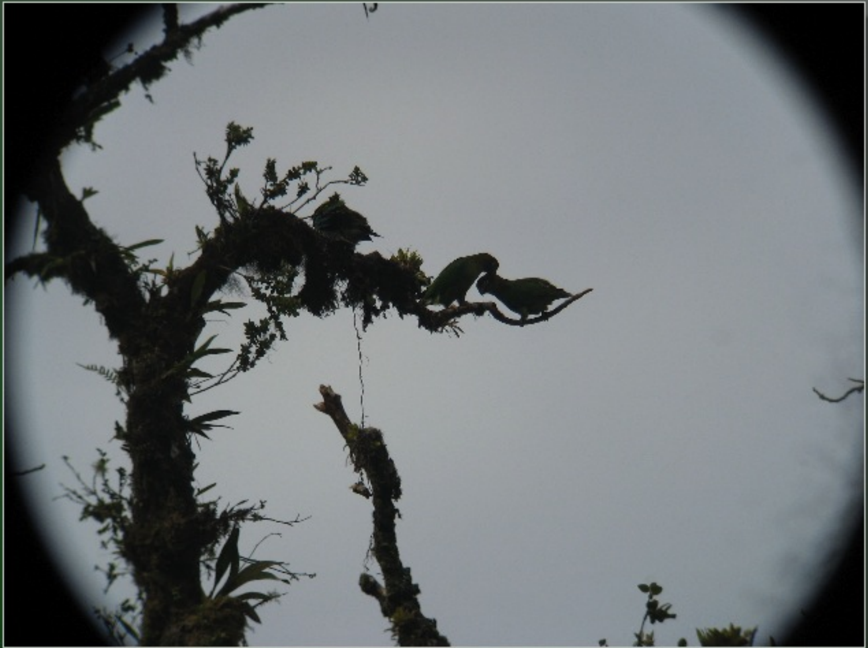
"A pair of birds, as seen through the telescope of our rain forest guide, Rodrigo."