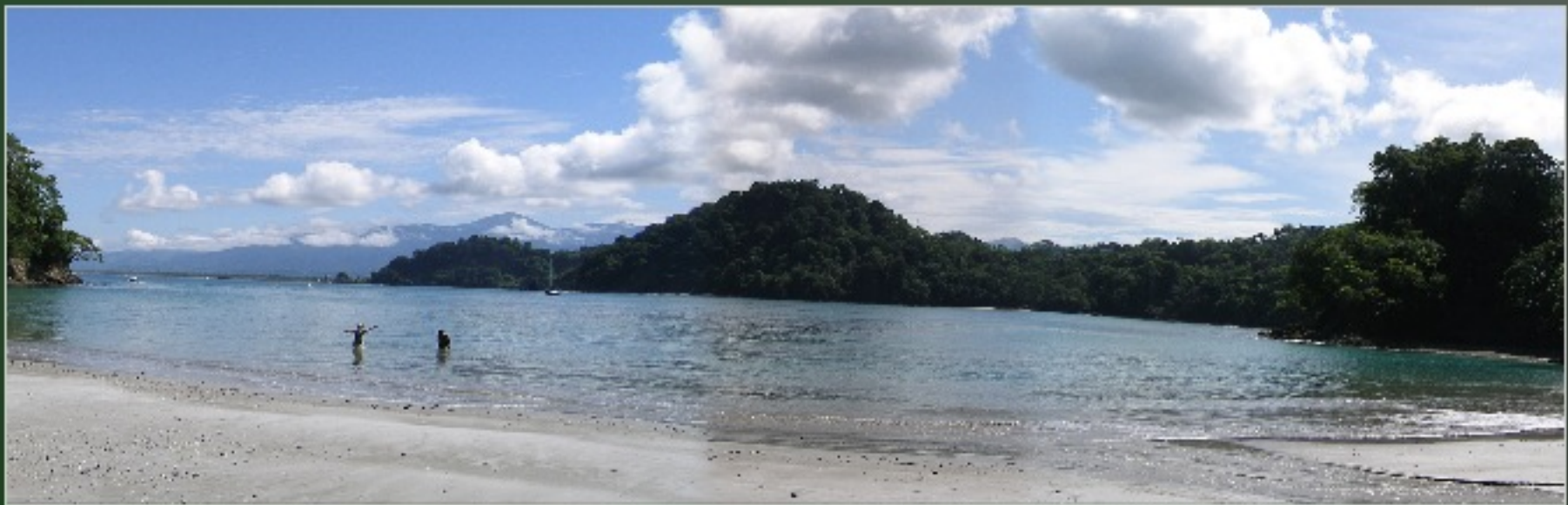
"Panorama of Pisan Beach in Manuel Antonio—Blend of 3 individual photos"