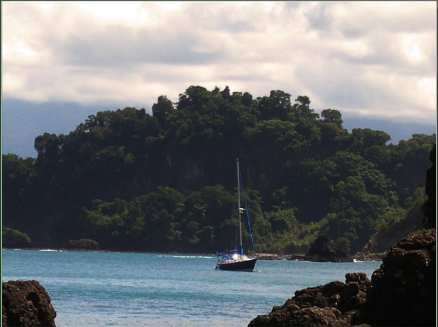
"An idyllic photo taken from the cove at a secluded beach in Manuel Antonio."