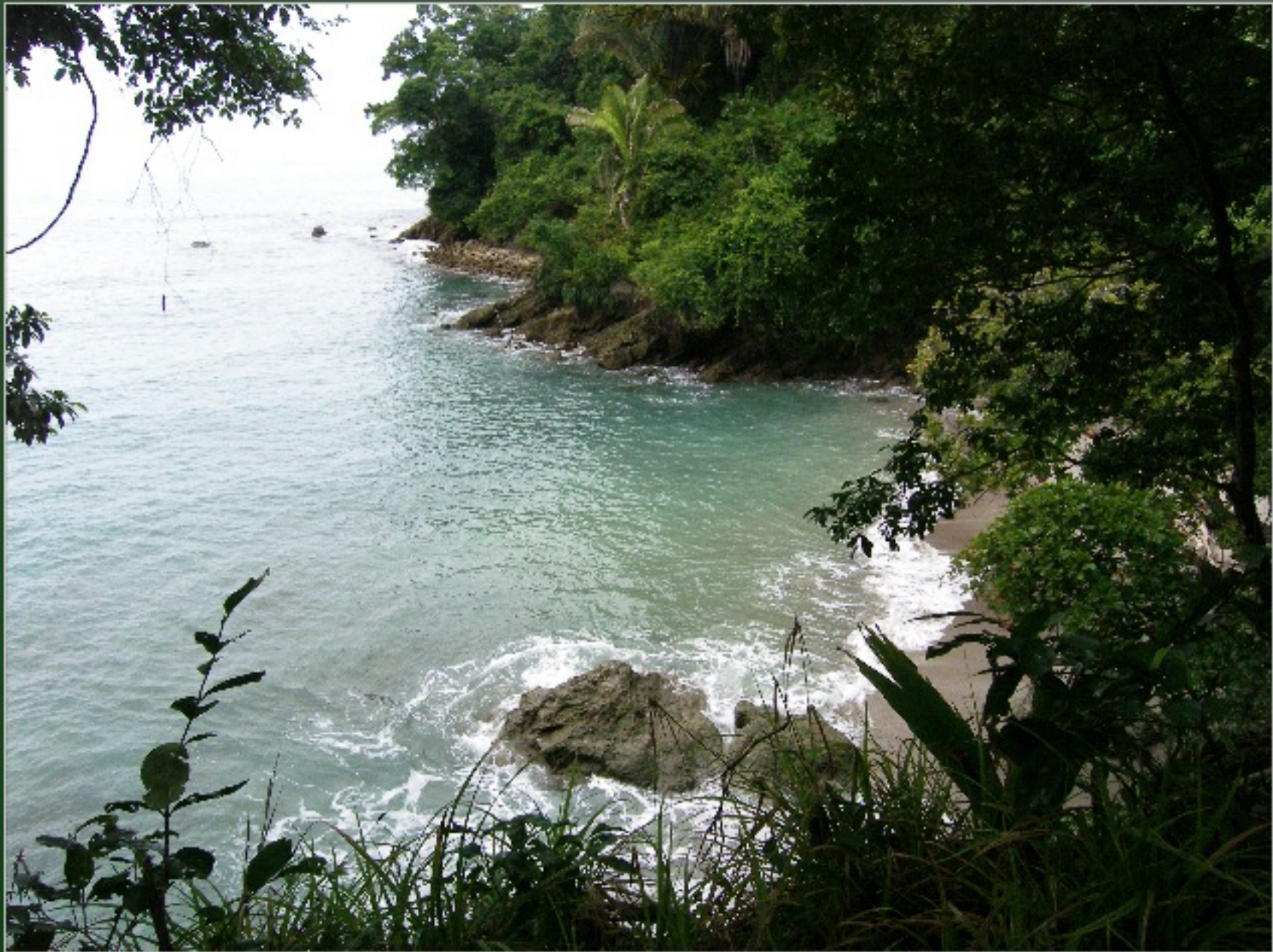
"A view of an ocan cove from the trail through the Manuel Antonio Reserve."