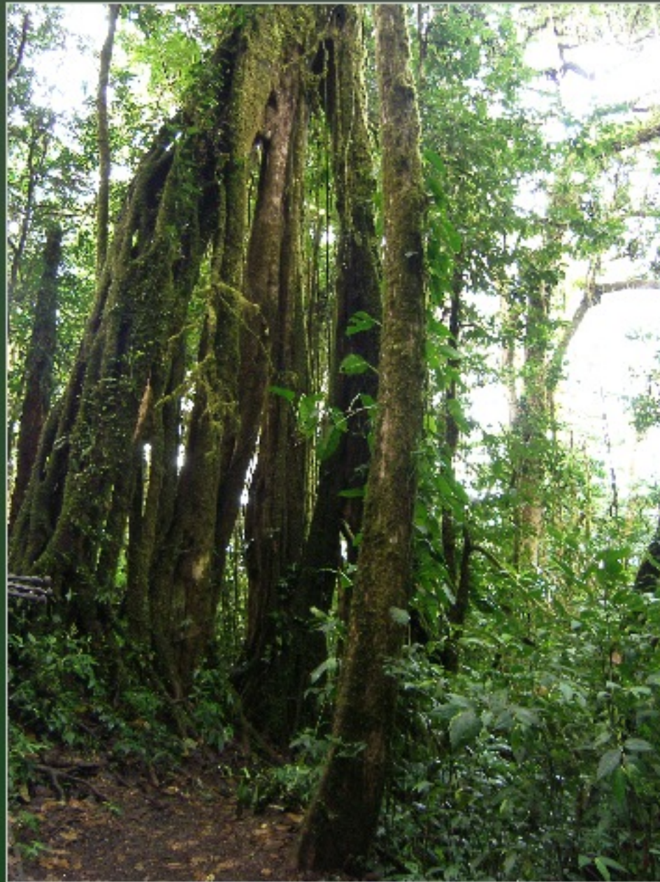
"A strangler fig (an epiphyte) in which the roots grow downward and strangle the tree that supports them."