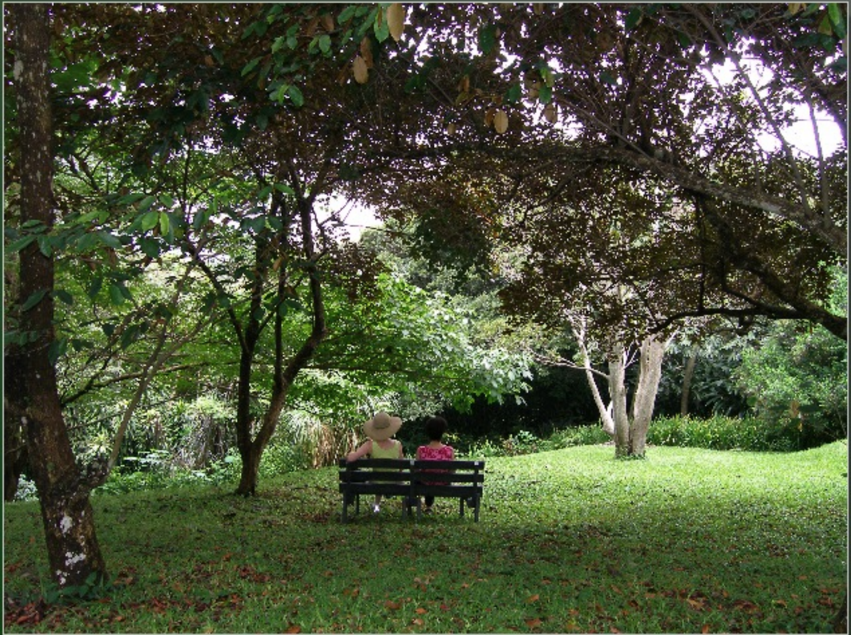
"An idyllic spot for communing with nature...."