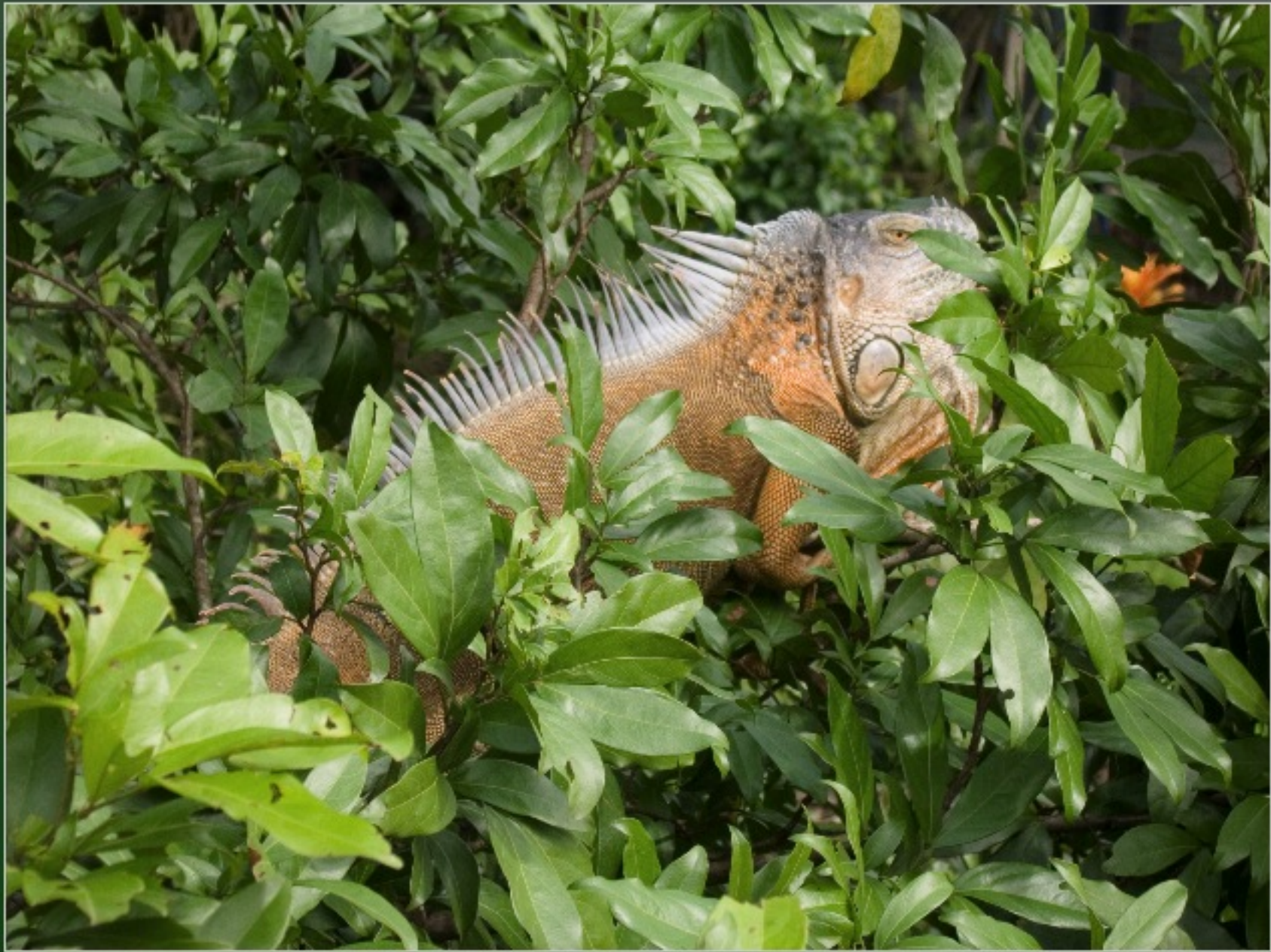
"During the bus ride to our boat tour of Canyo Negro, we stopped to see some iguanas, soaking up the sunshine."