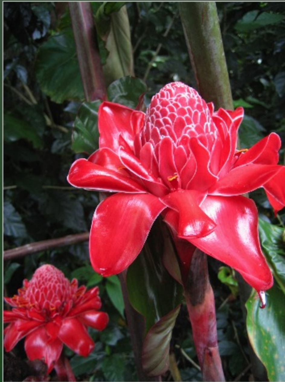
"Lynn snapped this photo of an amazing plant in a garden; it almost doesn't look real."