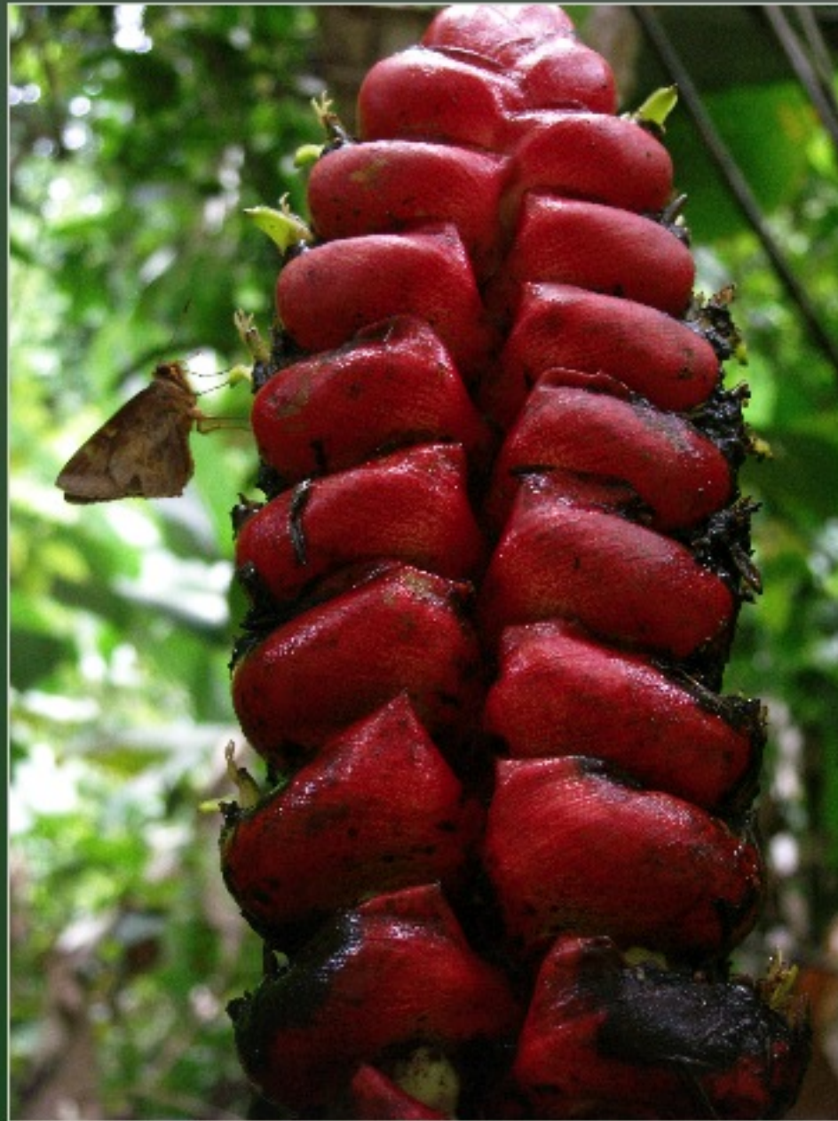
"Lynn really liked this photo of a butterfly—or maybe it's a moth—lighting on this beautiful plant."