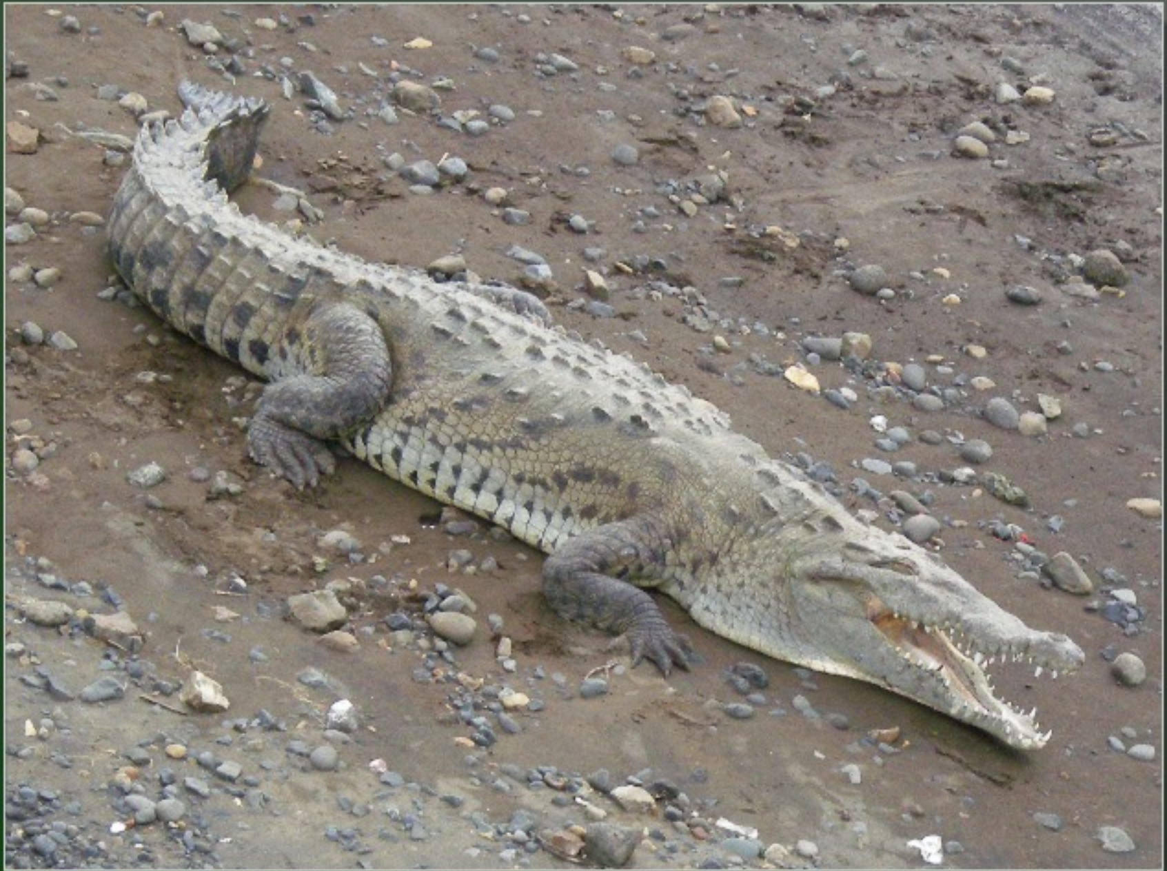
"Corcodiles in Costa Rica? Where's Captain Hook?"