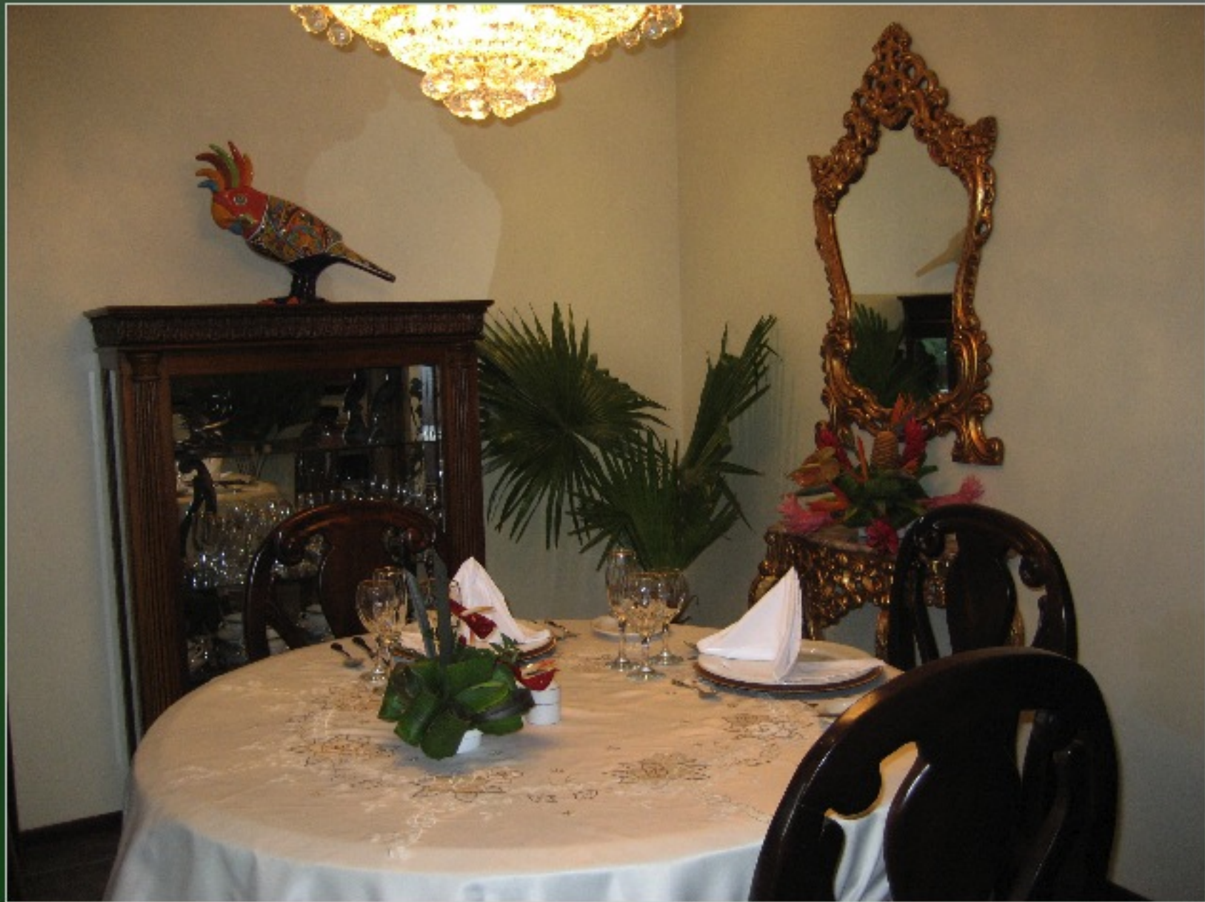
"Bob & Lynn's room in the Penthouse Suite at the Mansion Inn included a formal dining room."