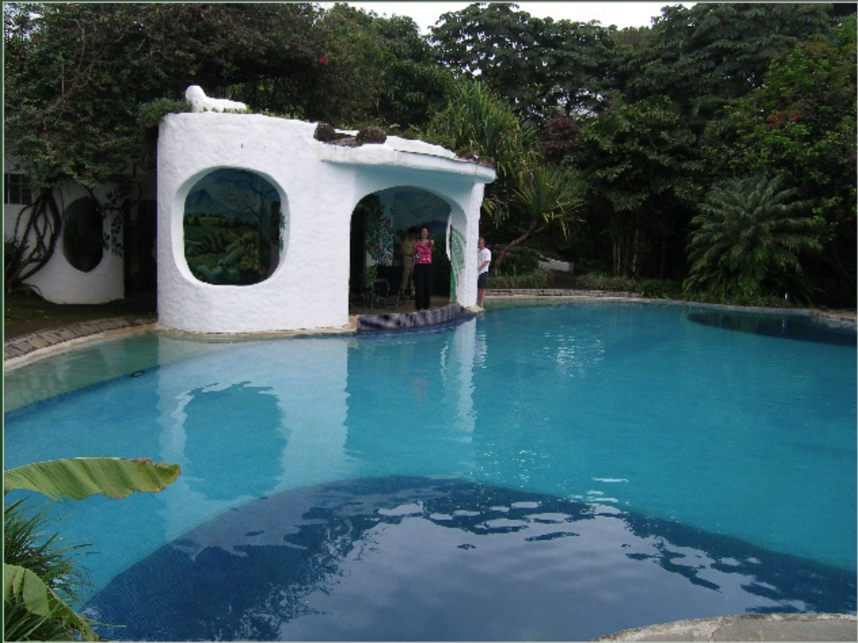
"Swimming pool and cabana at the Finca Rosa Blanca Inn"