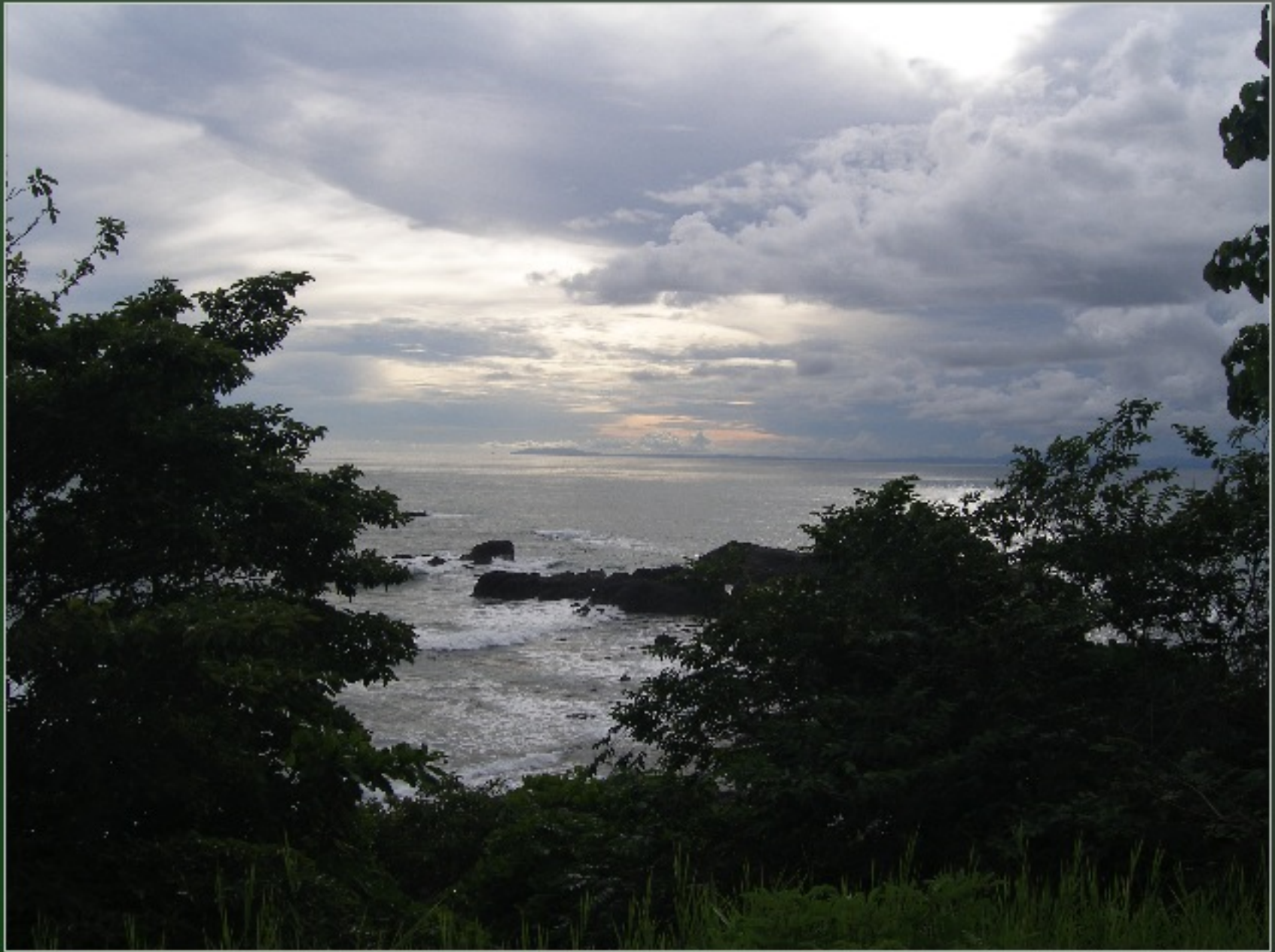
The weather in July is typically overcast in the afternoons, so this is the closest we got to a Costa Rican sunset photo."