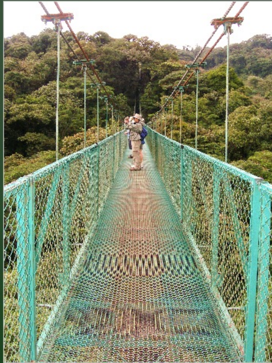
"One of 8 hanging bridges at Selvatura Park in the Monteverde cloud forest."