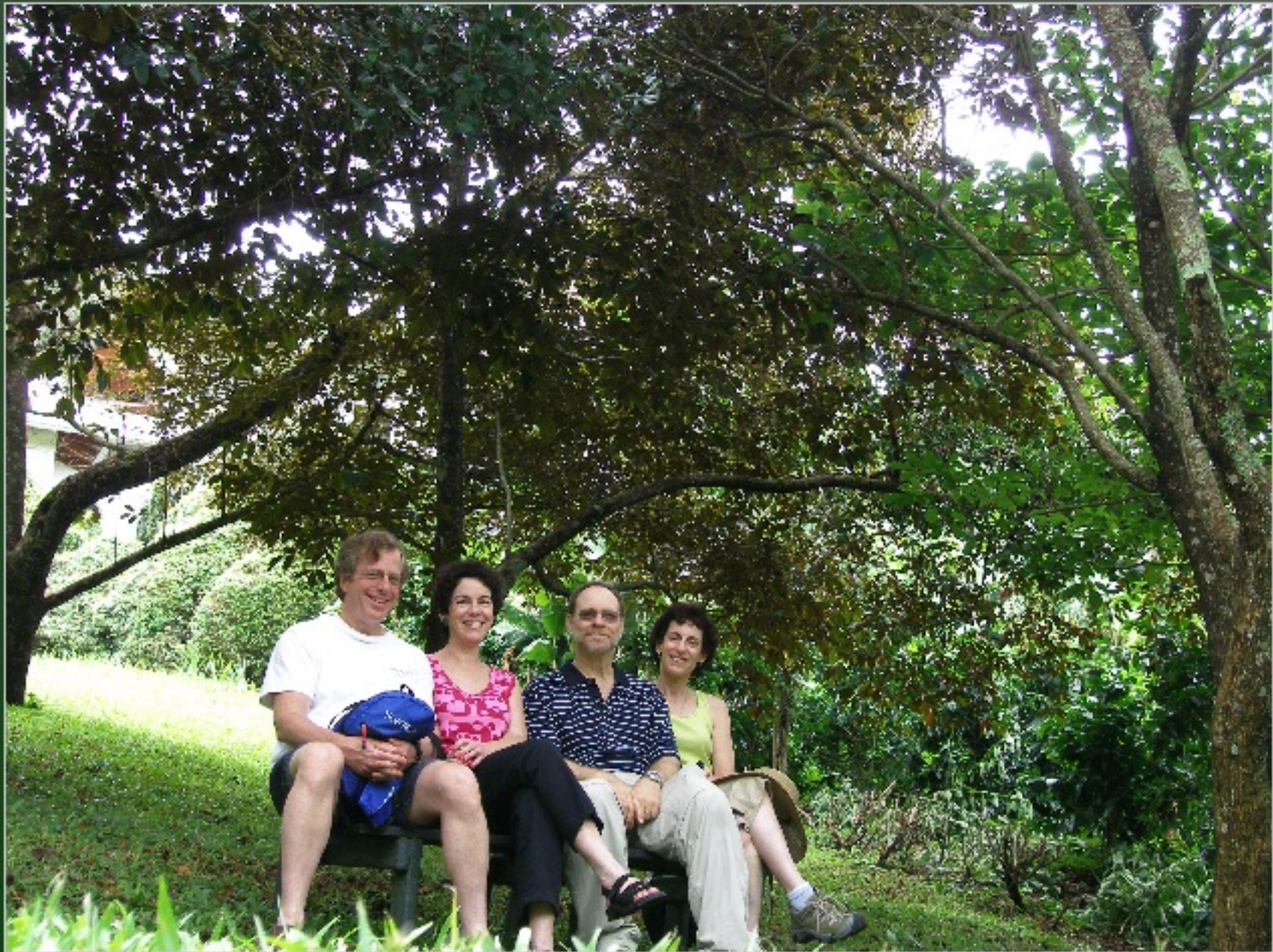
"Old friends...sat on a park bench like bookends...."