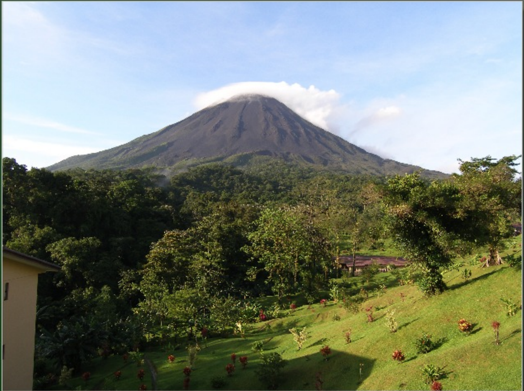
"The Arenal volcano, as seen from the balcony of our room at the Kioro Hotel on a clear morning."