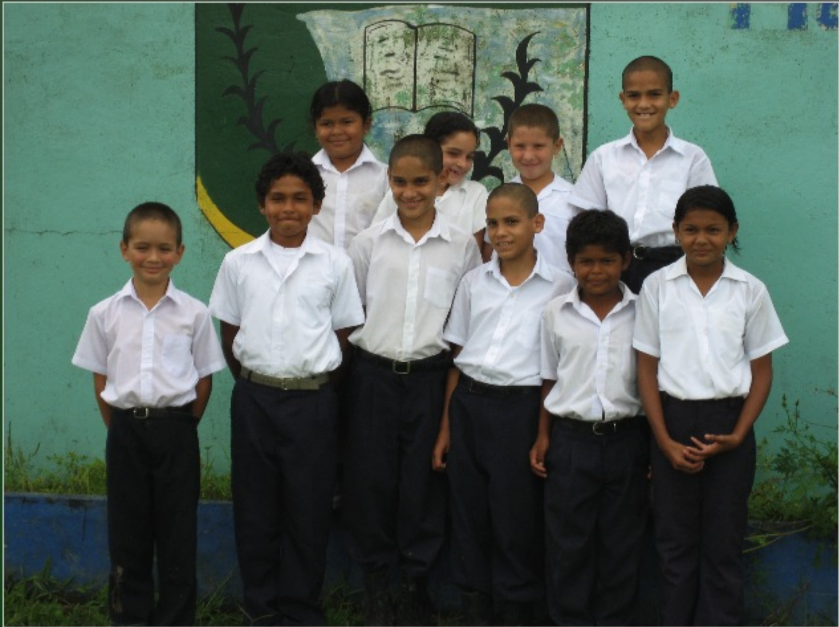
"Students at a school on the the infamous long, windy, and extremely bumpy road from Arenal to Monteverde.."