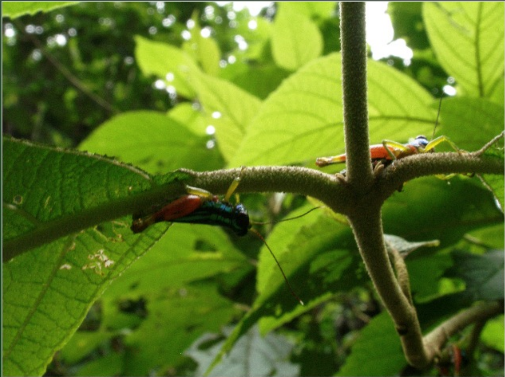
"Bob took this photo of grass hoppers on a leaf during our morning hike through the forest."