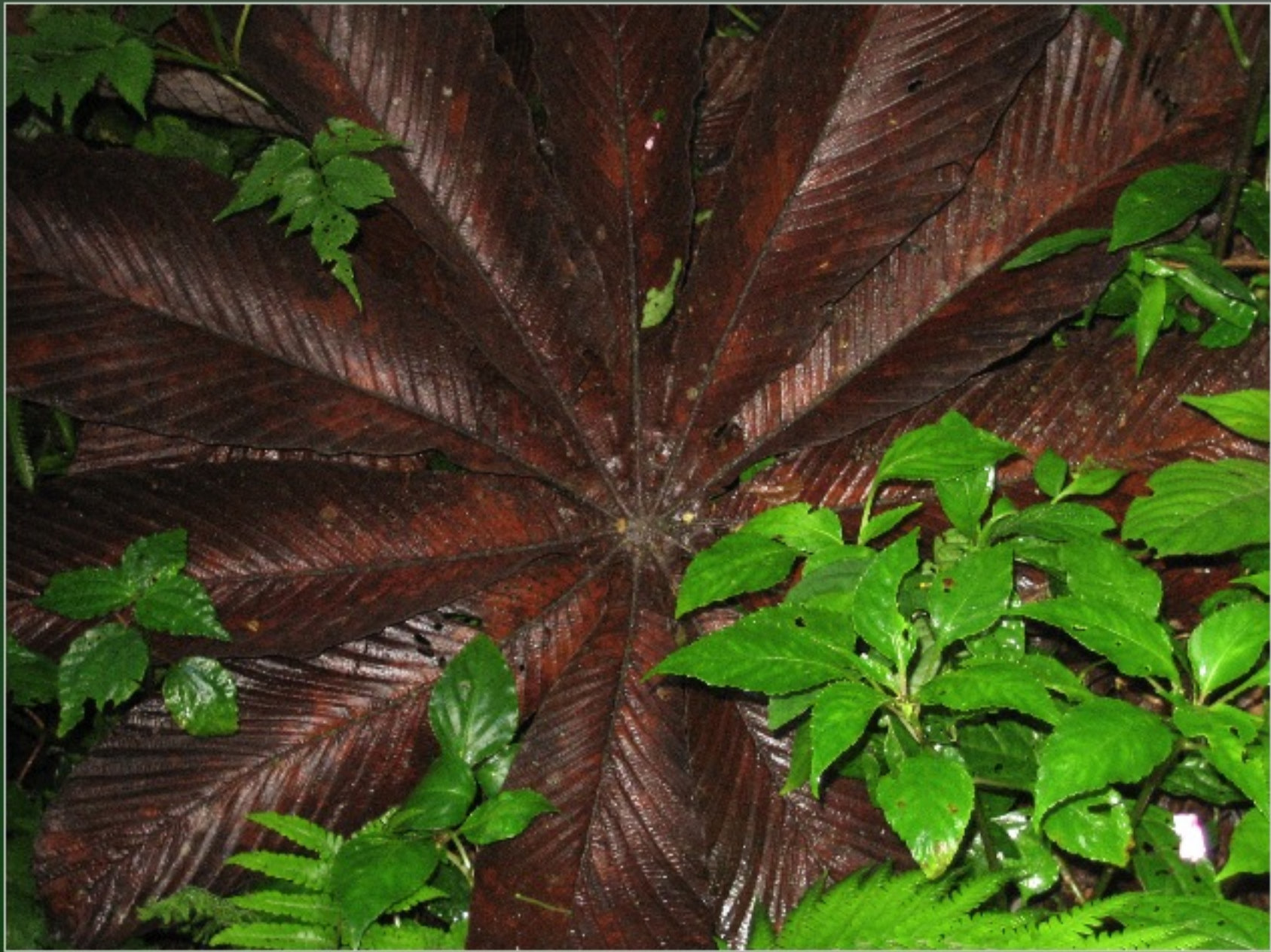
"Lynn really got into taking photos of interesting natural shapes and patterns with her new digital camera."