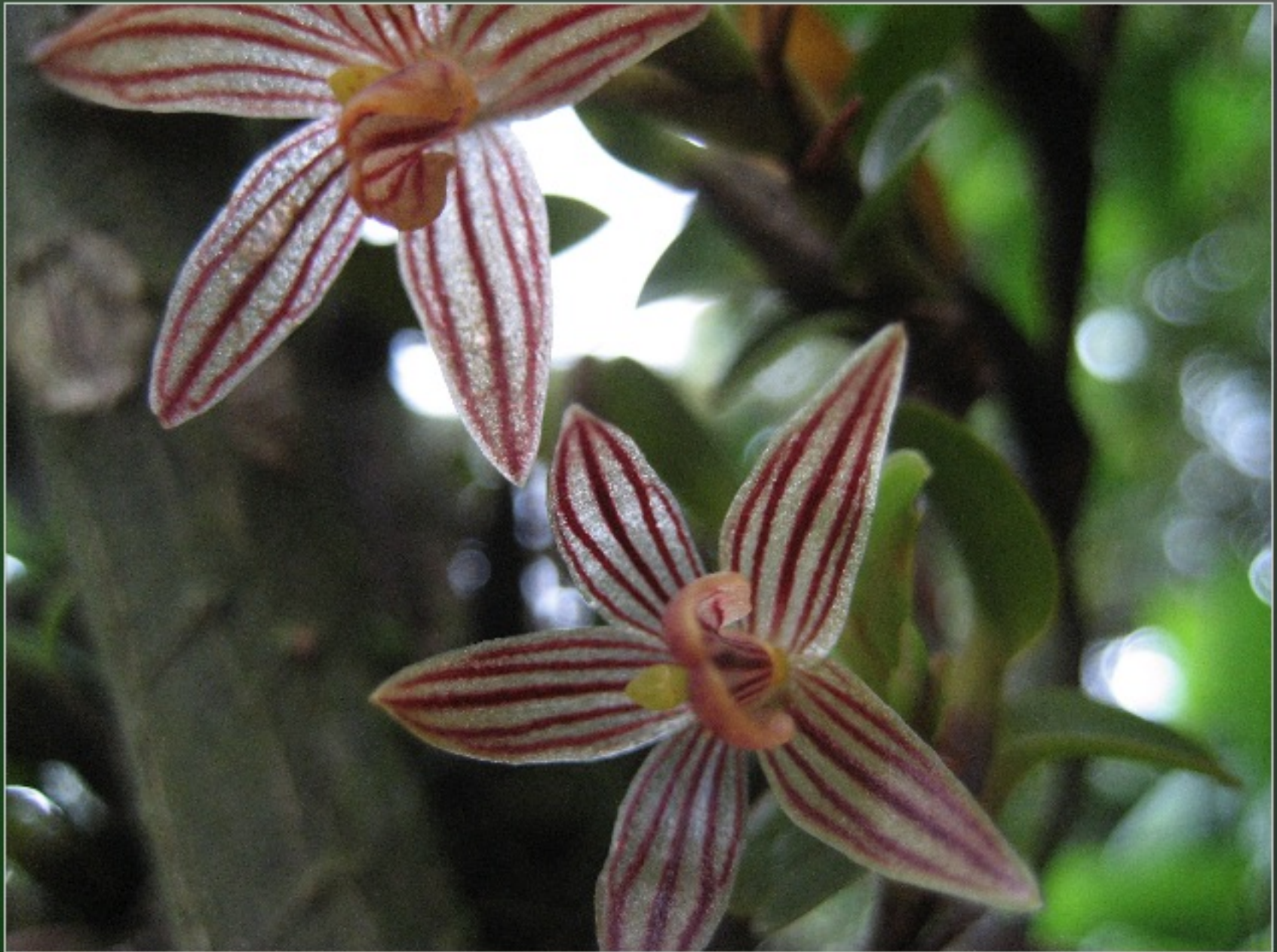
"Lynn loved the beautiful translucent leaves of this flower at the Orchid Museum."