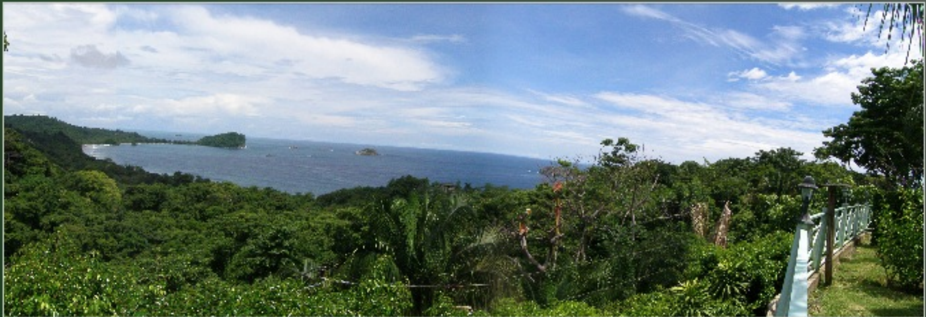
"Panoramic view from La Mansion Hotel balcony in Manuel Antonio, blended from 3 individual shots."