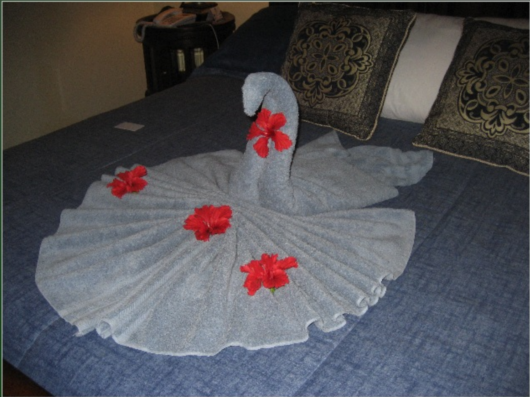
"Each day, the fresh towels in our room at the Mansion Inn were arranged in a lovely pattern, like this swan."