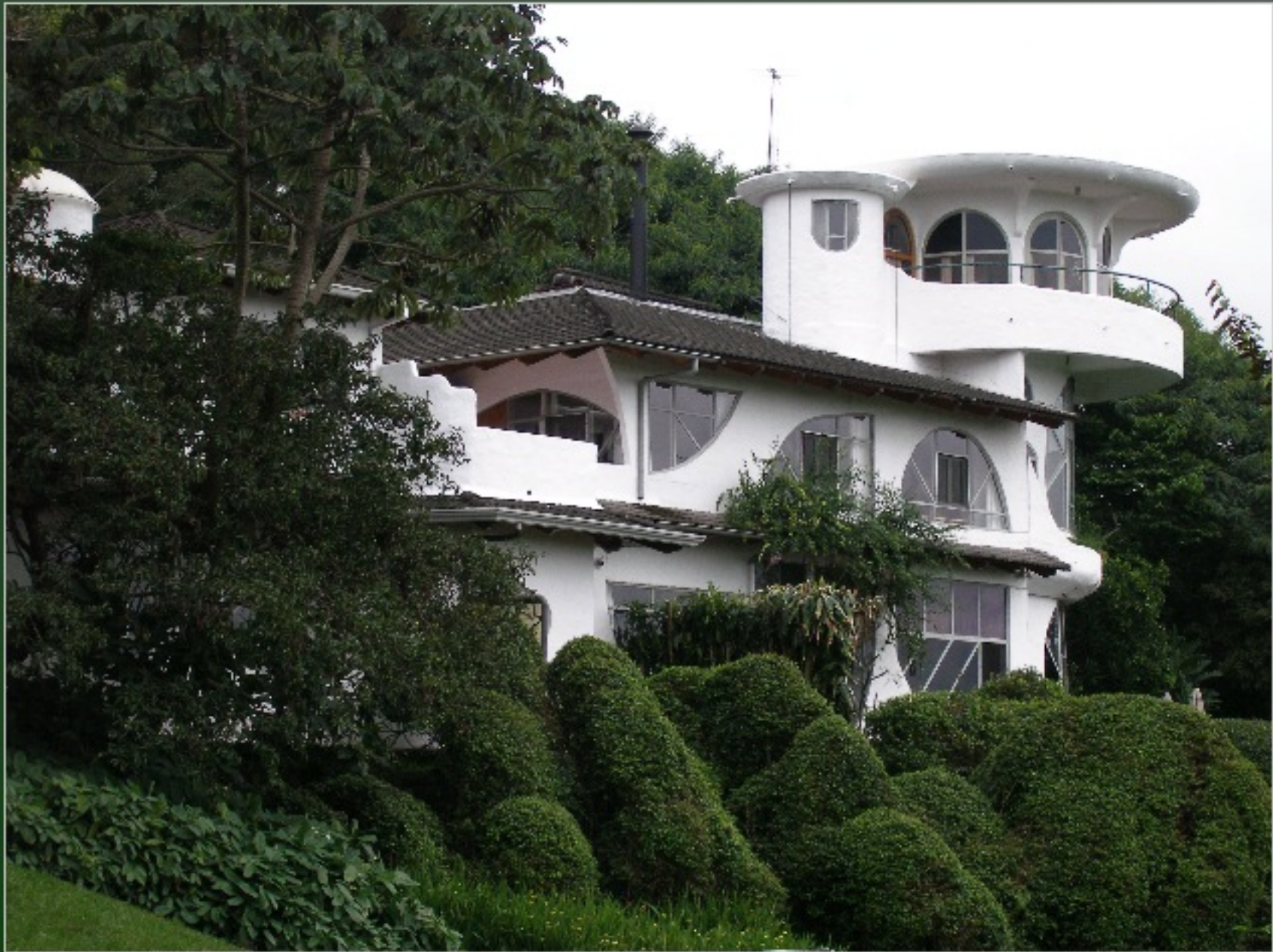
"Outside view of the Finca Rosa Blanca Inn in the Santa Barbara area, above San Jose, Costa Rica"