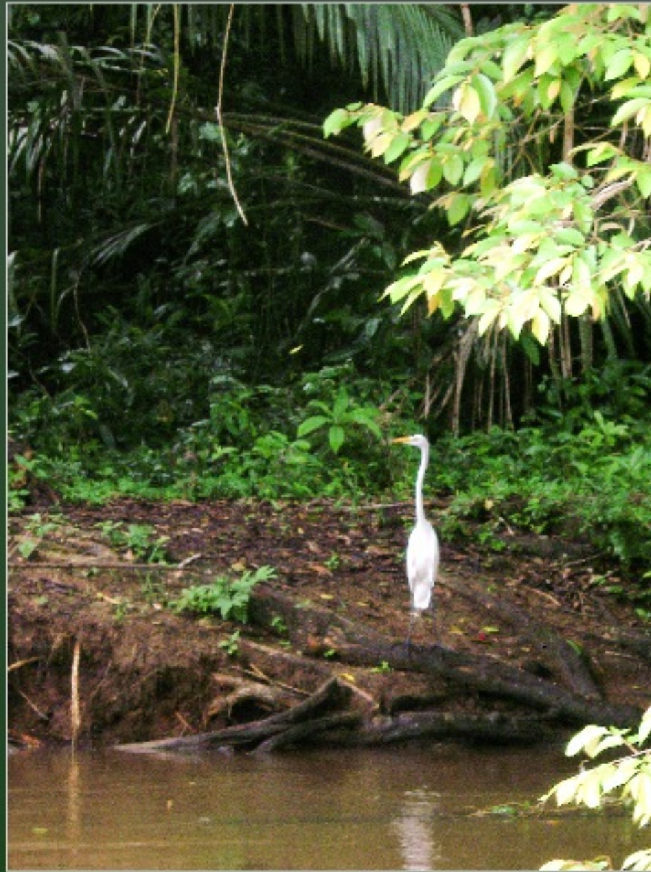
"An egret, I think. This is one of many, many birds we saw on our Canyo Negro boat ride."