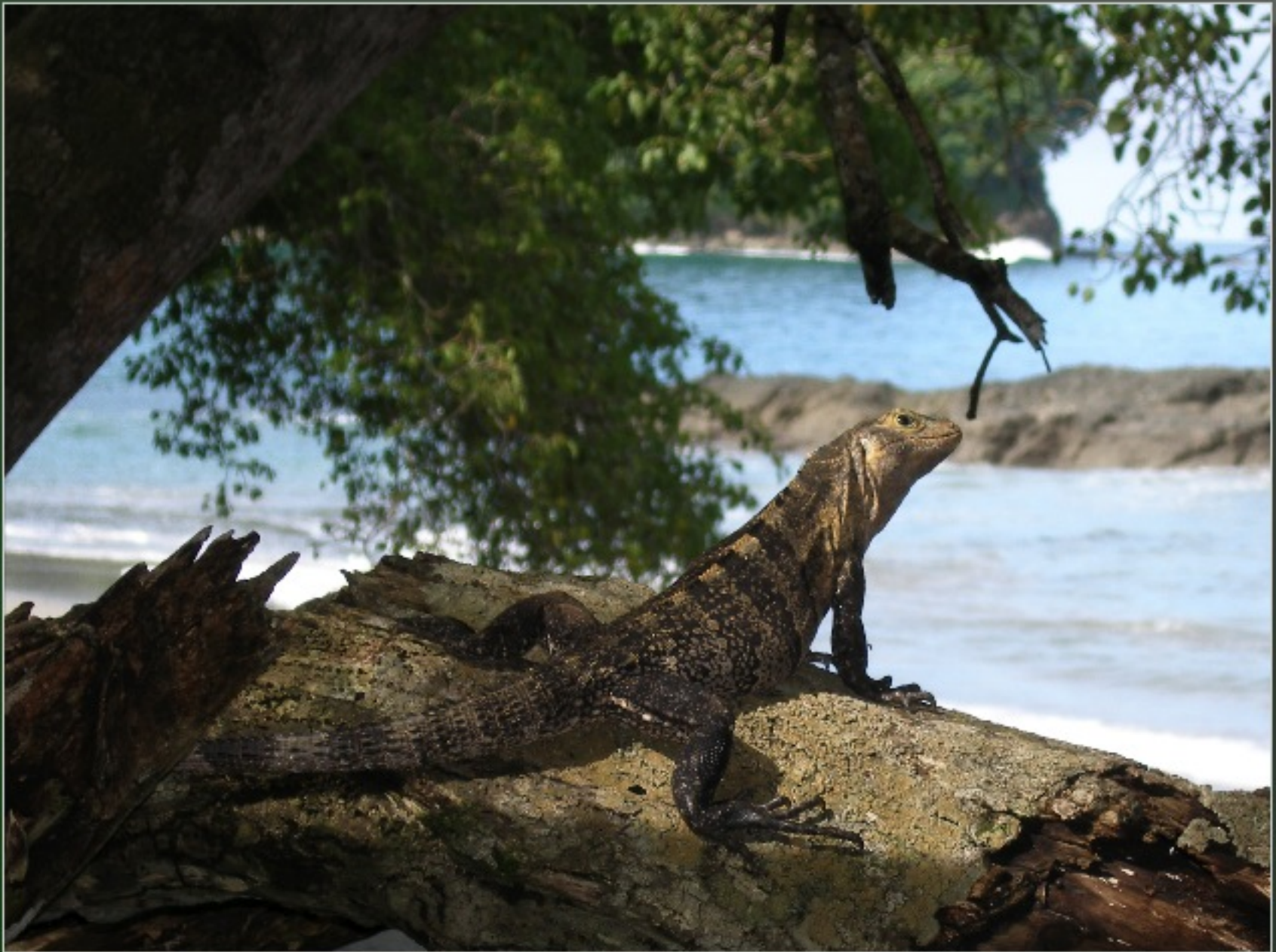
"A smiling lizard, sunning itself on a log at the Reserve in Manual Antonio."