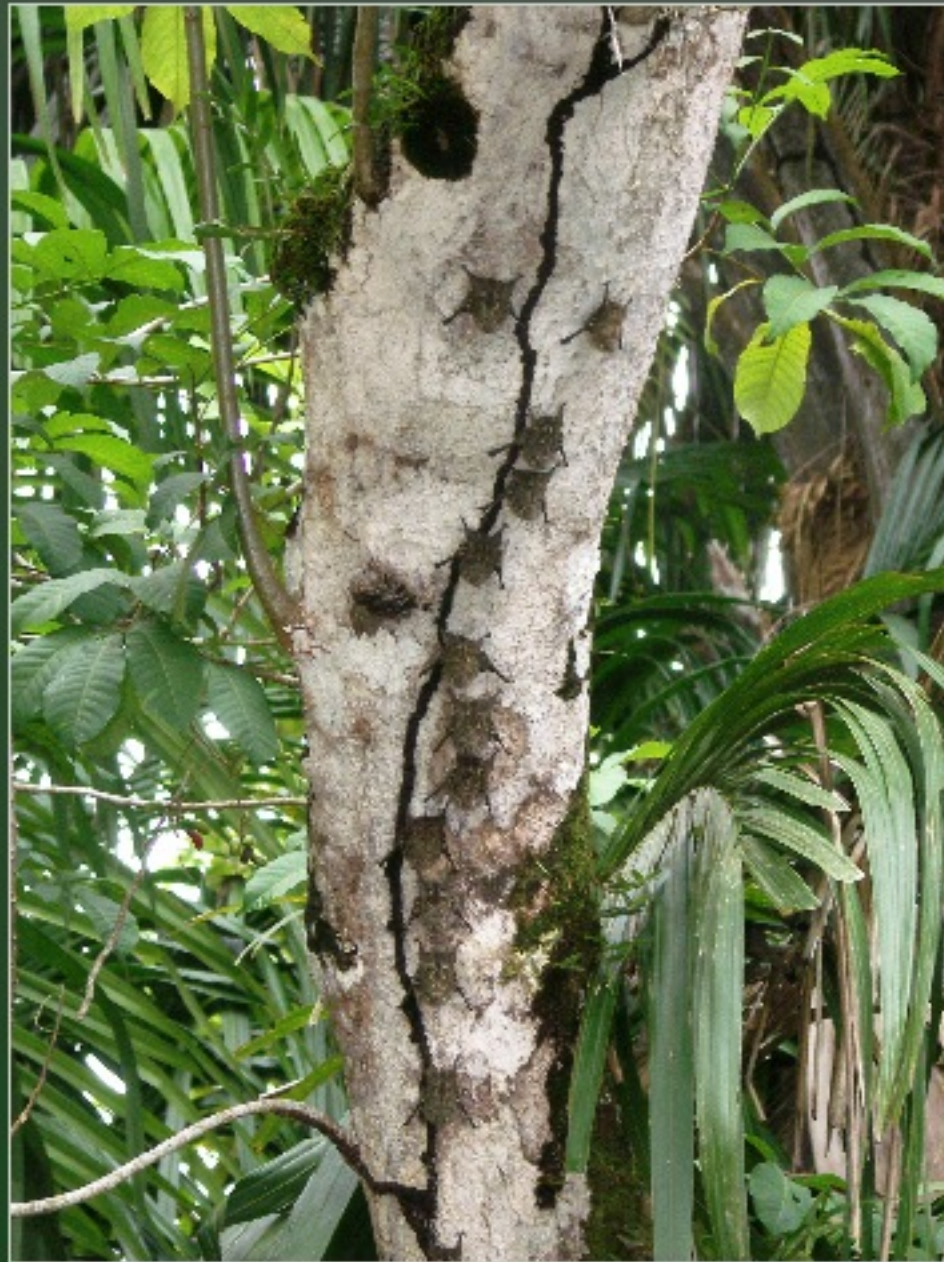
"Look closely; those aren't spots on the tree—they're bats!"