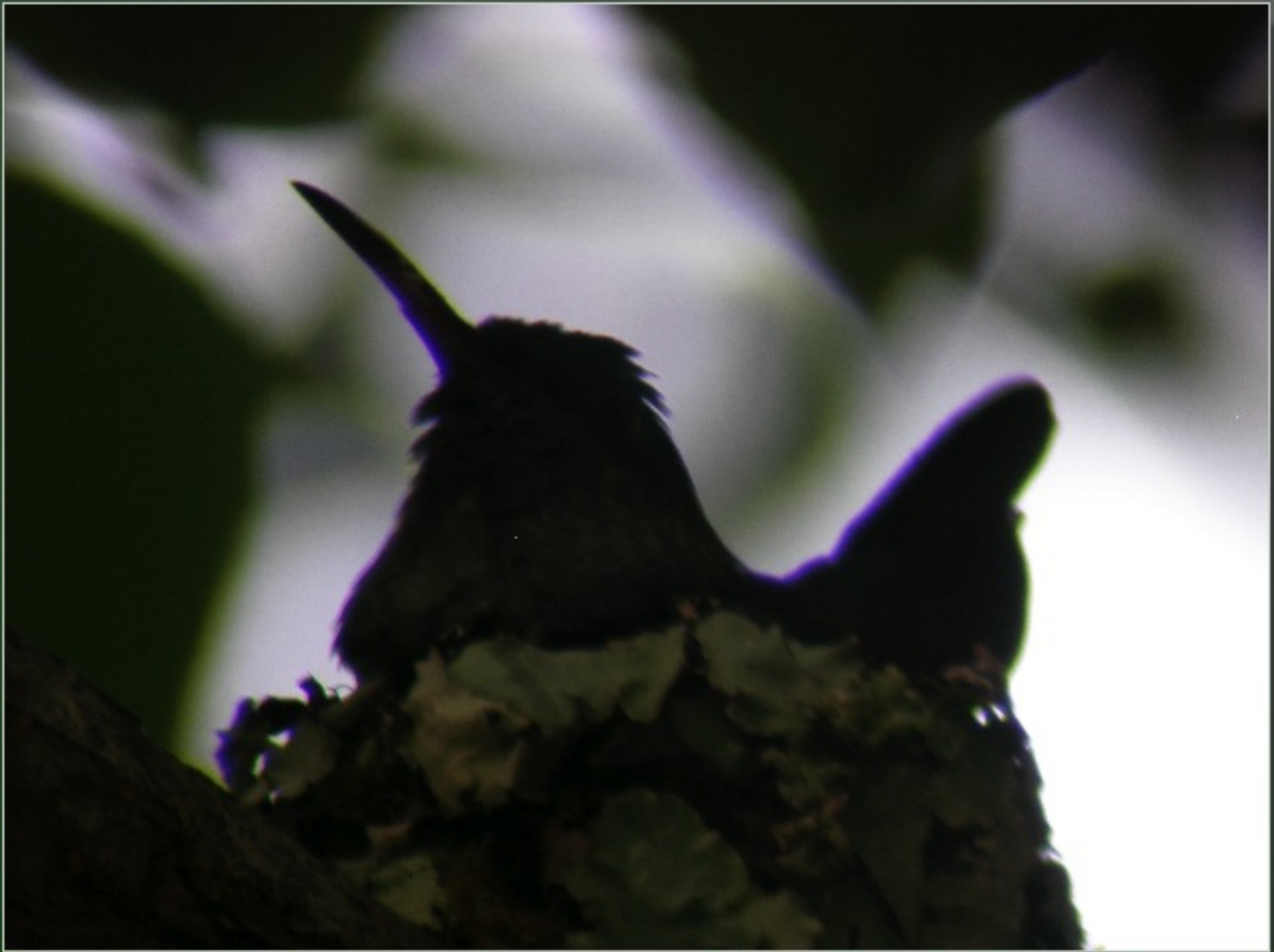
resting bird, as seen through the telescope of Henry, our English-speaking guide through the Manual Antonio Reserve