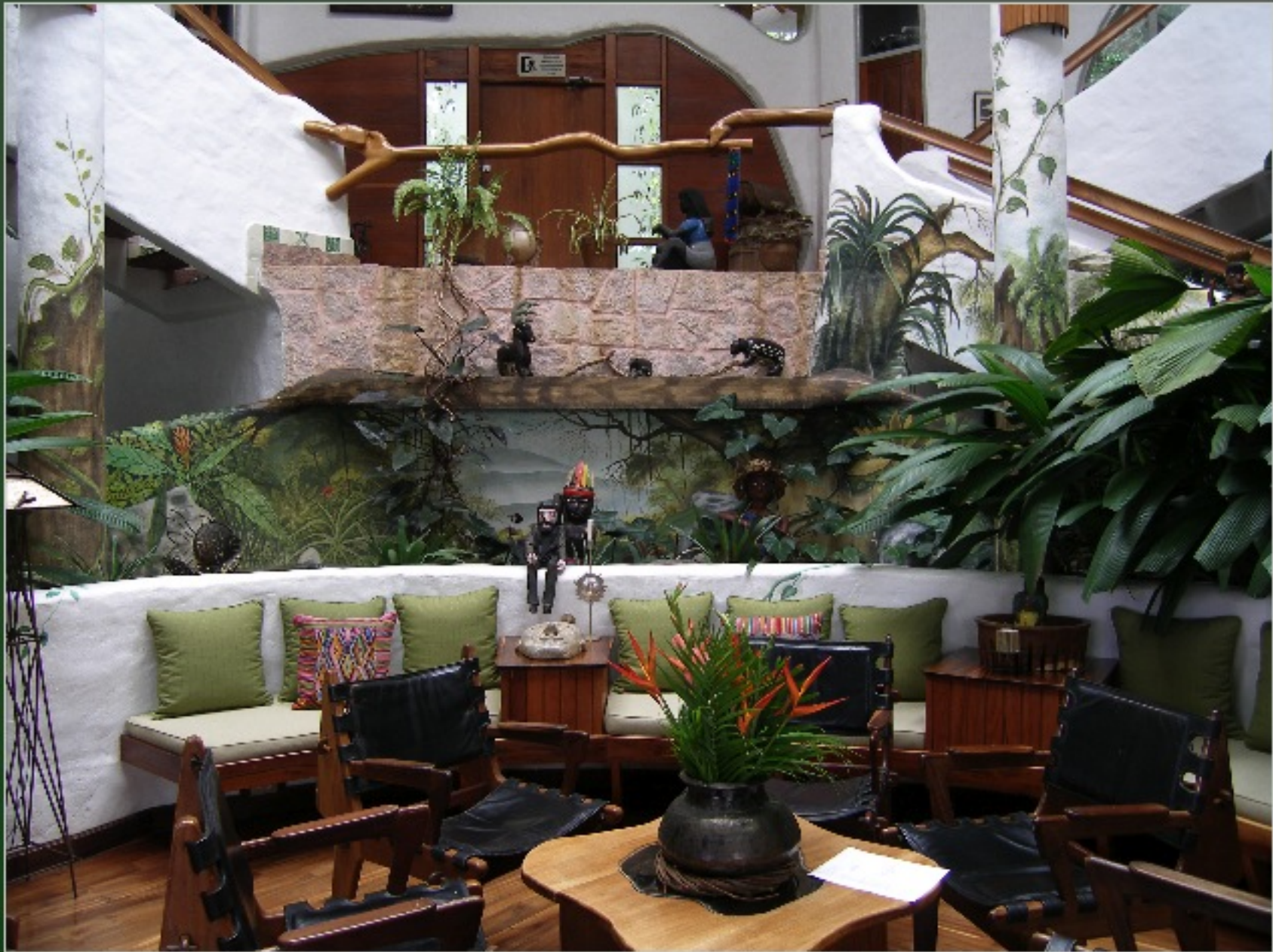
"Lobby area at the beautiful Finca Rosa Blanca Inn"