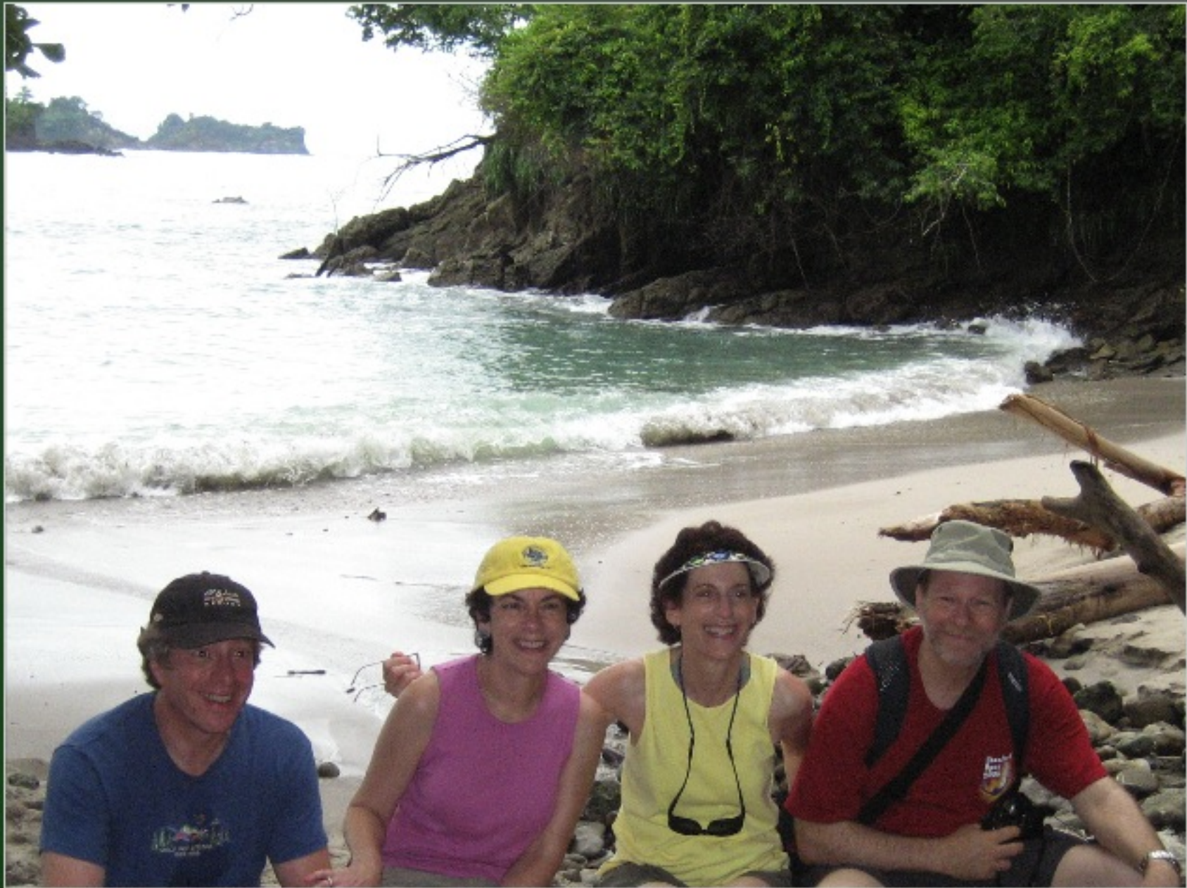
"We all sat for a photo during our morning hike through the Manuel Antonio Reserve."