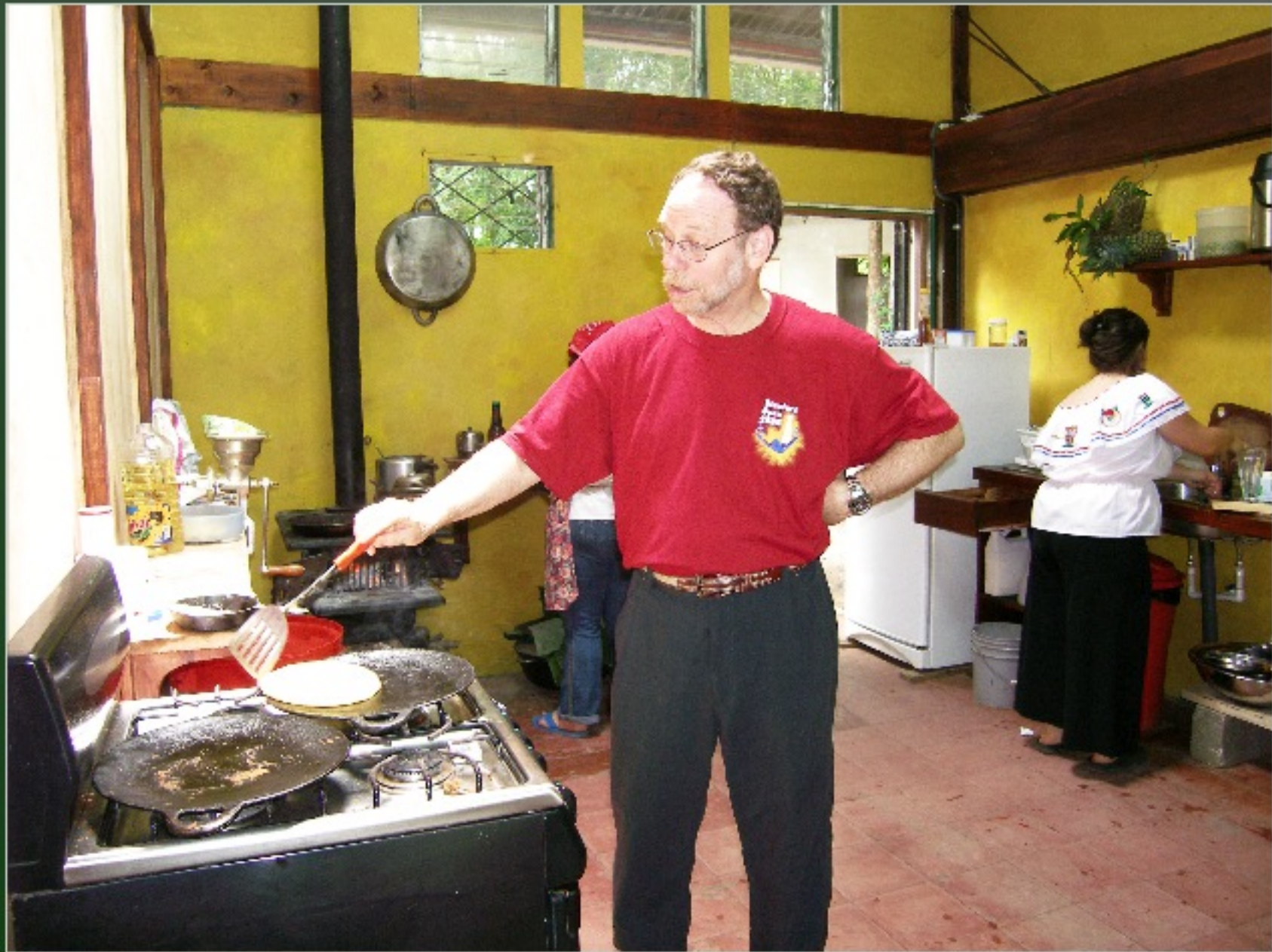
"After shaping a tortilla, you fry it in oil, being careful not to burn it."