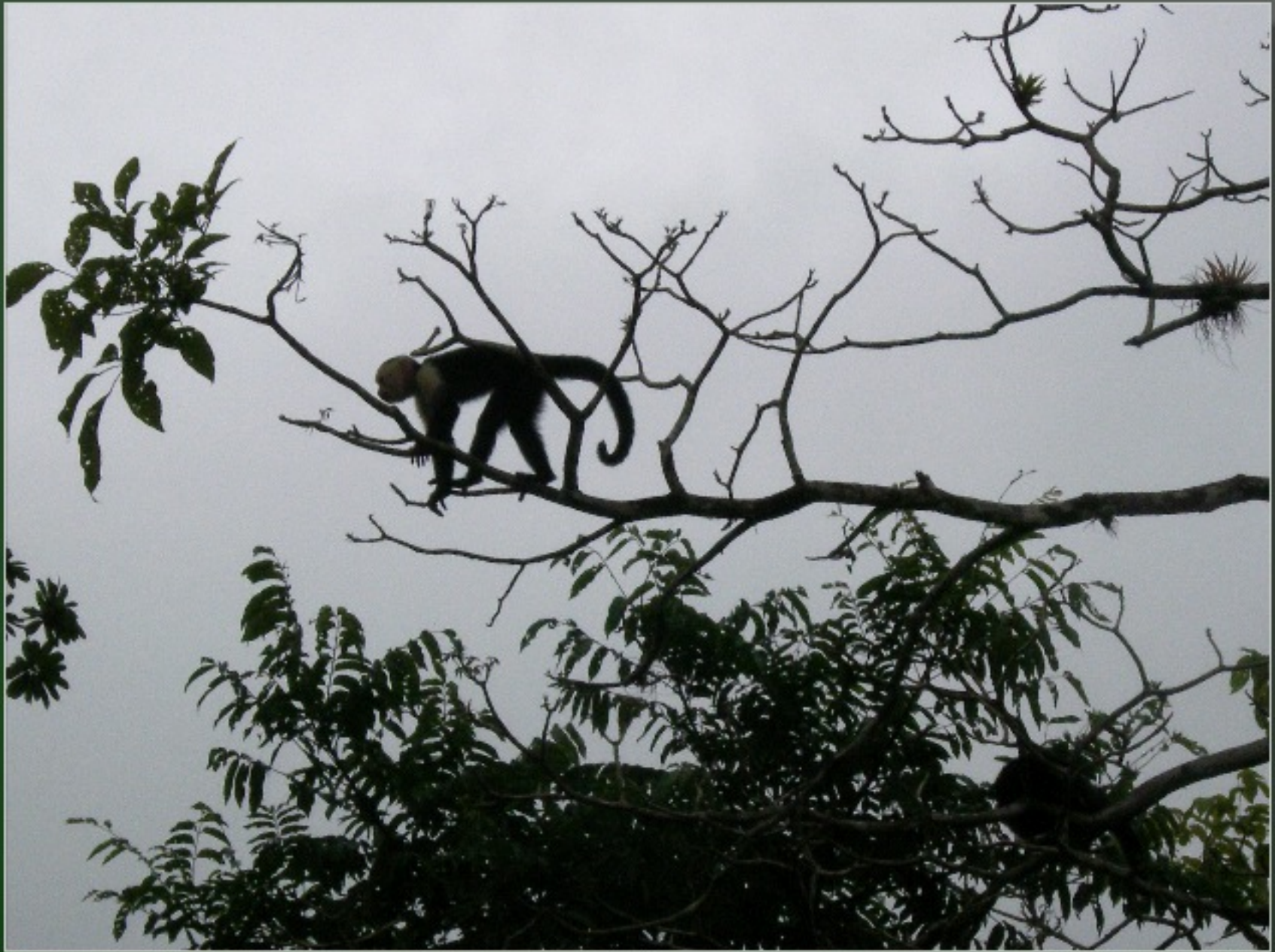
"A white-faced Capuchin monkey about to leap to another tree."