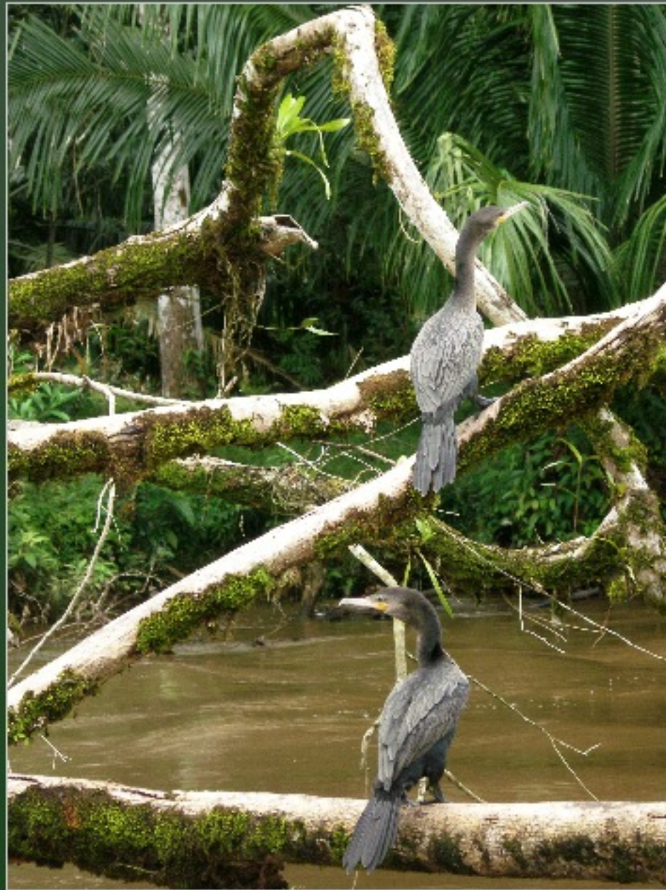
"More water fowl...can't remember what kind."