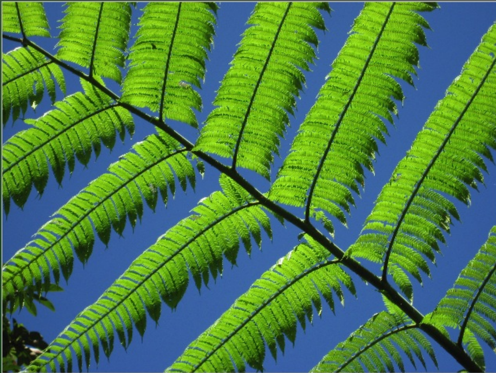
"Here's another photo taken by Lynn of a fern leaf against a very blue sky"