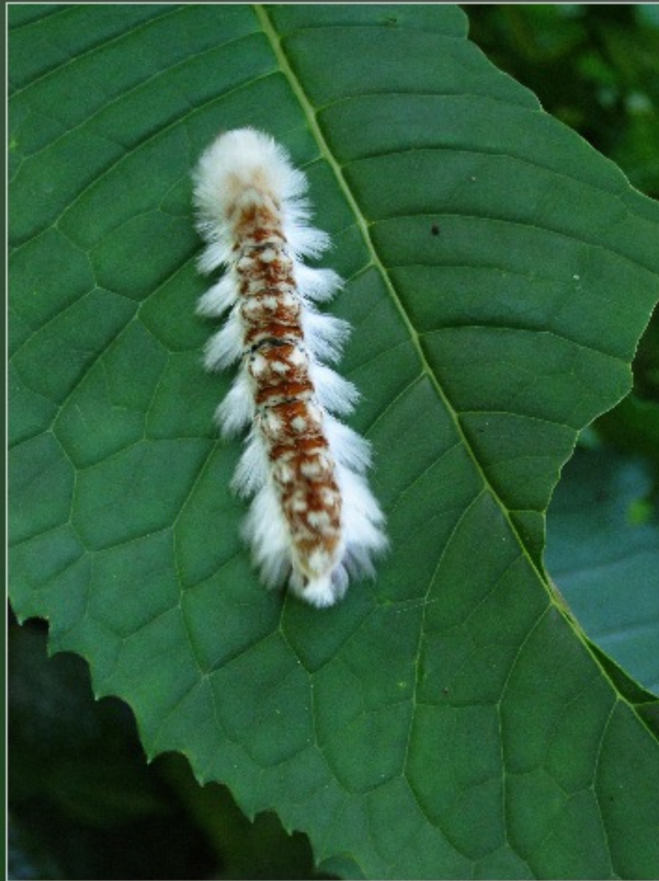
"This caterpillar was more than happy to pose for our cameras"